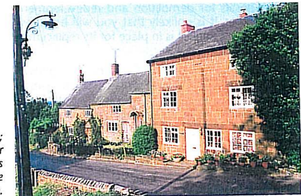
Detailing is simple; lintels are stone or timber and windows never dominate the building facade.

Where property boundaries define the limits of the Conservation Area, all features forming the boundary (e.g. walls, hedges, trees etc.) are assumed to be wholly within the Conservation Area.