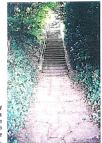
Tree-lined pathways extend from the church down to the village.